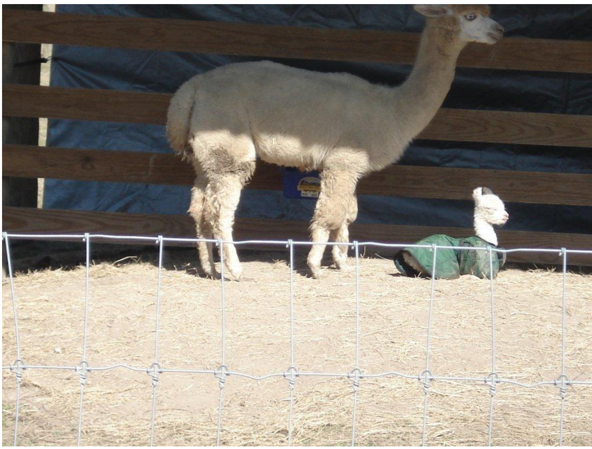
This picture shows Bacall and her first cria. She is a good mom and her weight now averages around 156 pounds.